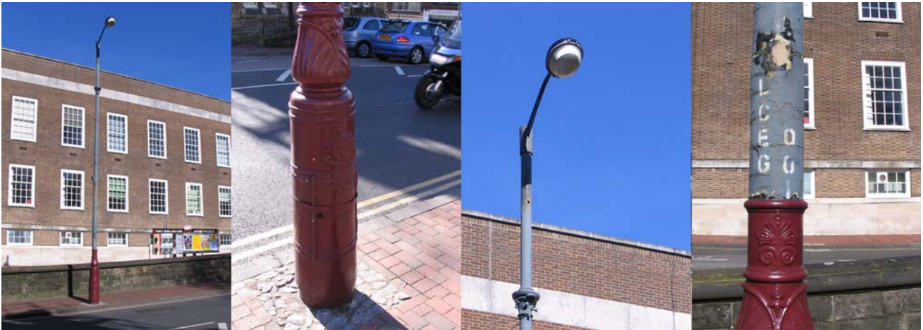
33 / LCEG001 Crescent Road