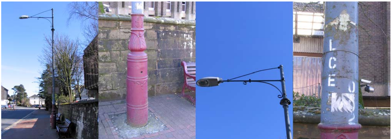
38 / LCE?002 Crescent Road

1) paint flaking on column, top and base