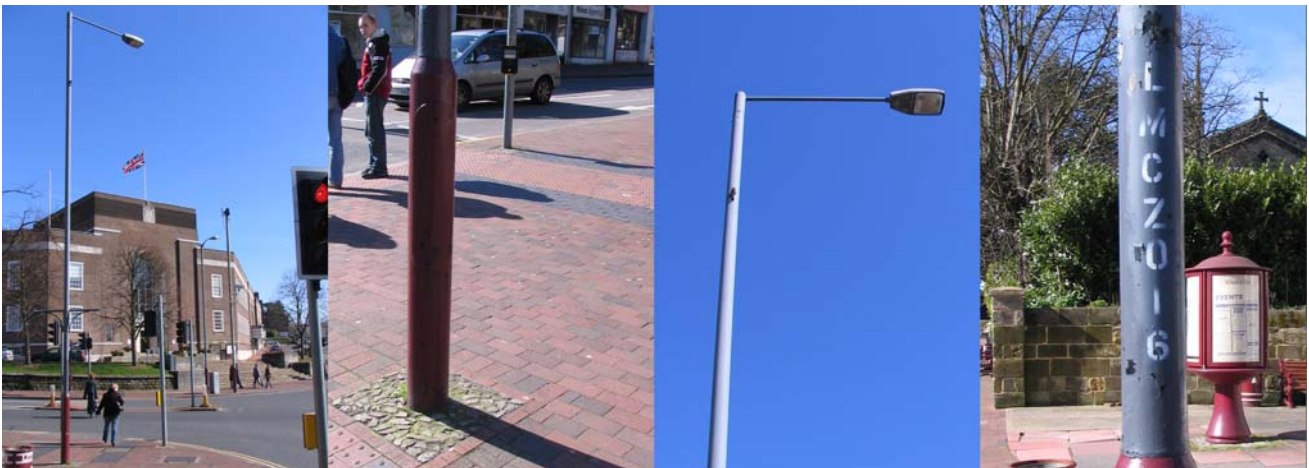
28 / LMCZ016 Mt. Pleasant / Church Road