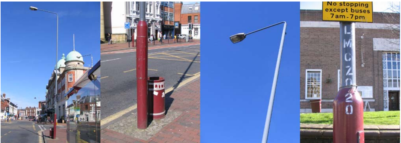
6 / LMCZ020 Mt. Pleasant