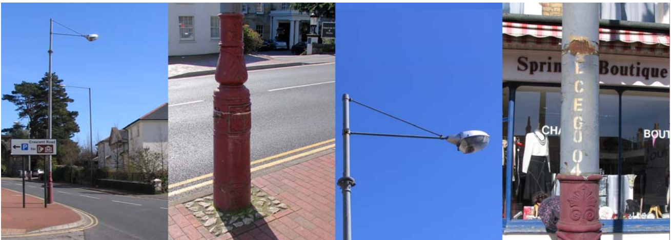
34 / LCEG004 Crescent Road