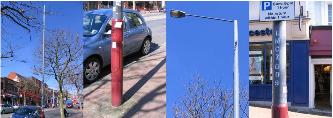
13 / LMCZ009 Mt. Pleasant