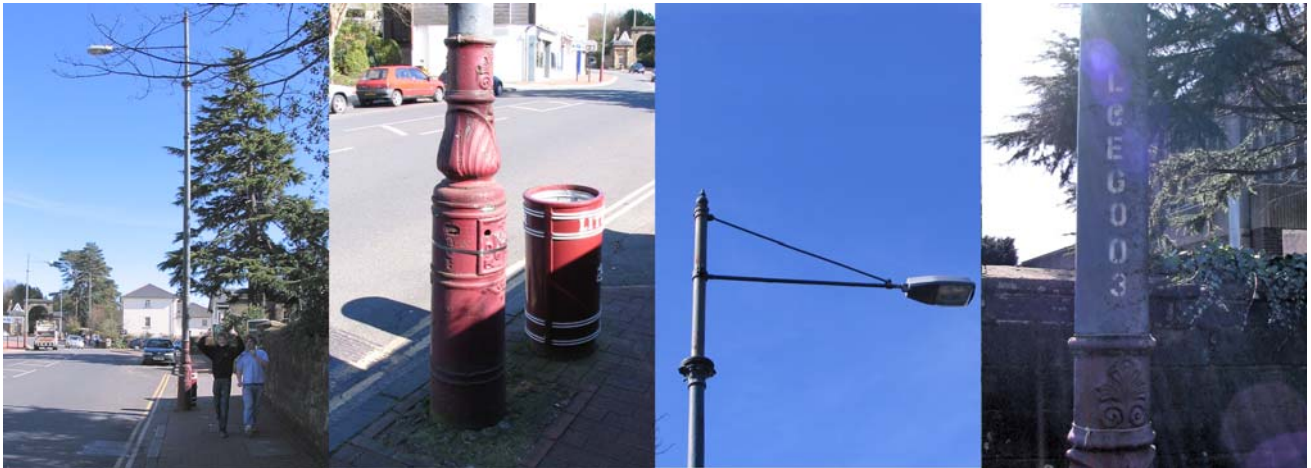
37 / LCEG003 Crescent Road