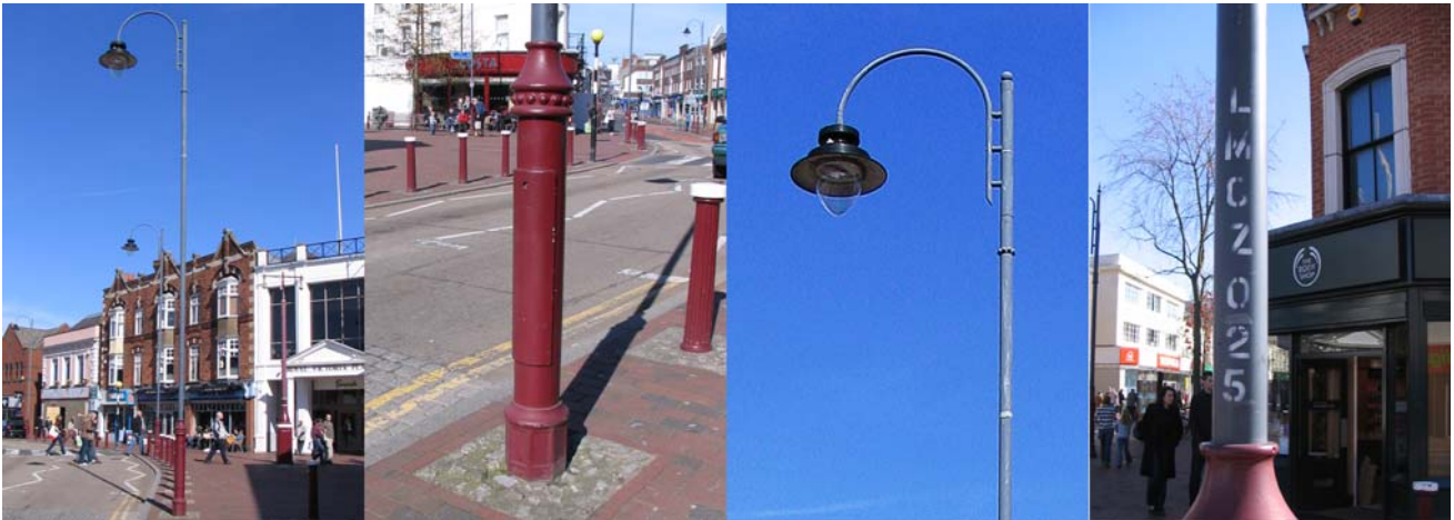
3 / LMCZ025 Five Ways