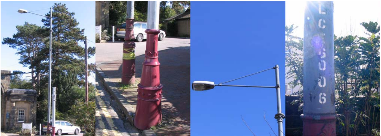
35 / LCEG006 Crescent Road