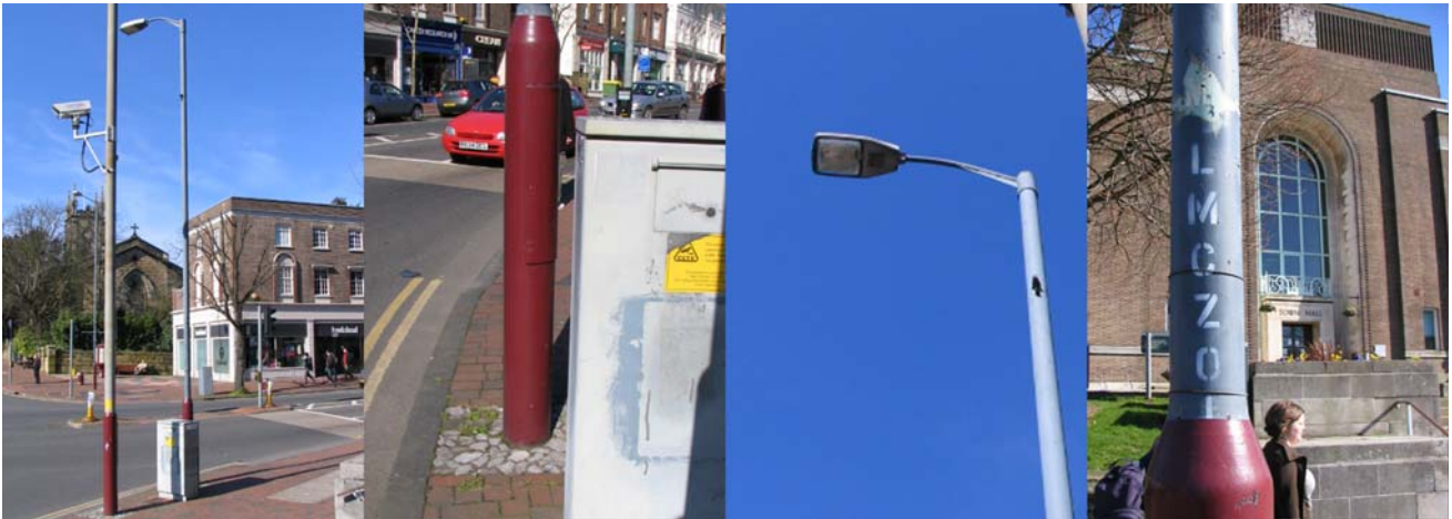
9 / LMCZ01? Mt. Pleasant