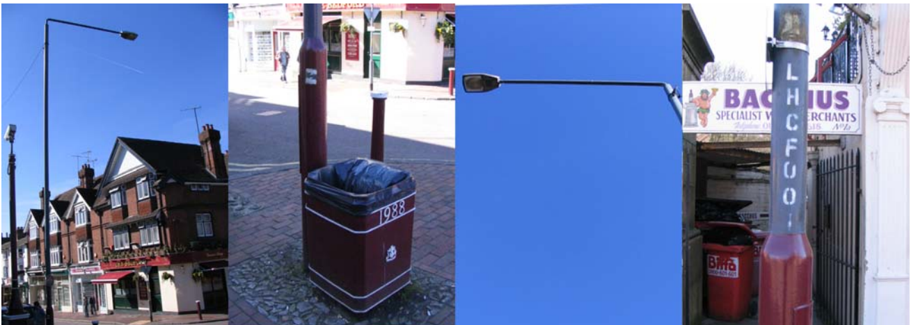
18 / LHCF001 Mt. Pleasant / High Street