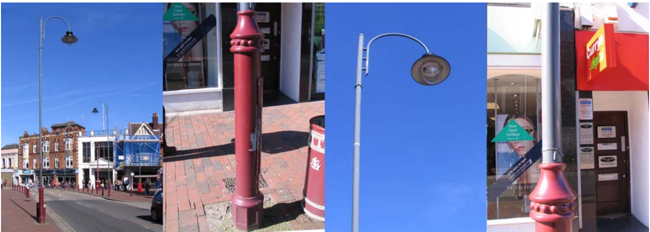
32 / Mt. Pleasant