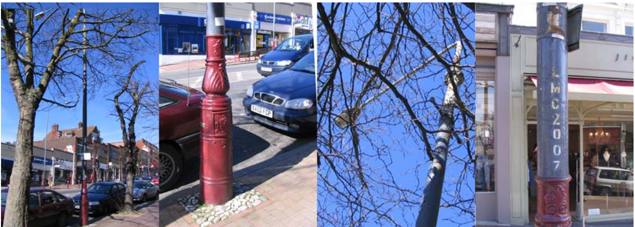
14 / LMCZ007 Mt. Pleasant

1) column set into concrete instead of cobble stones