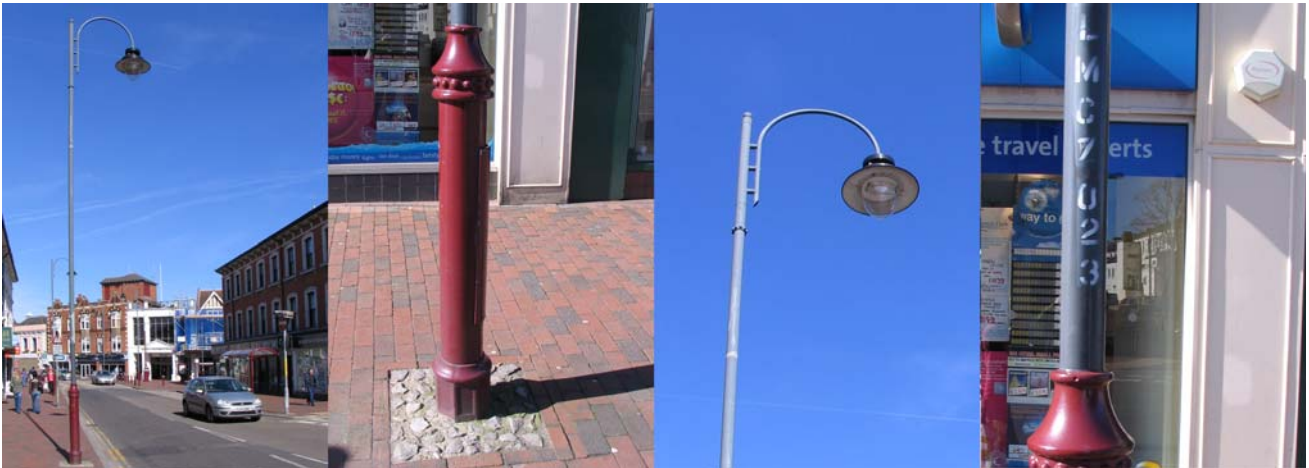
31 / LMCZ023 Mt. Pleasant