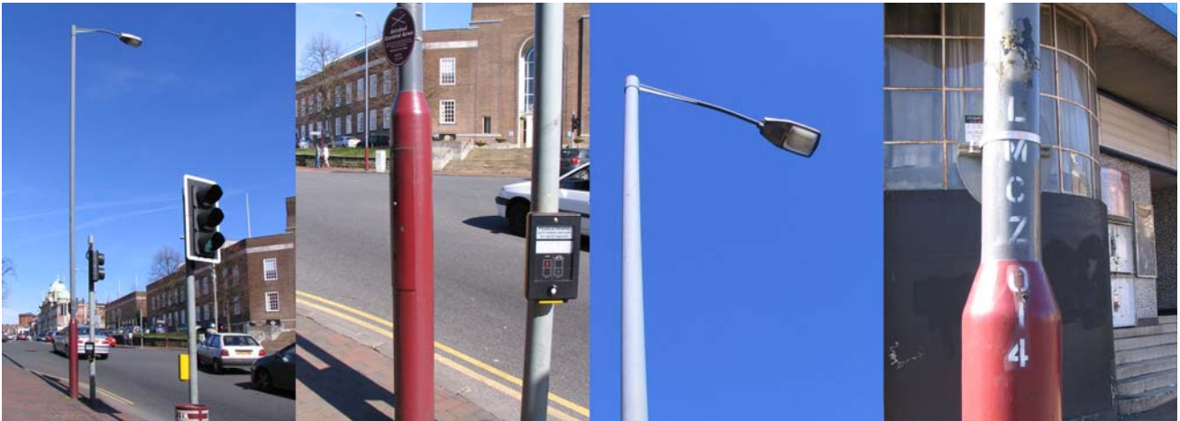
27 / LMCZ014 Mt. Pleasant