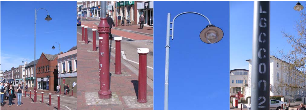
1 / LGCC002 Five Ways