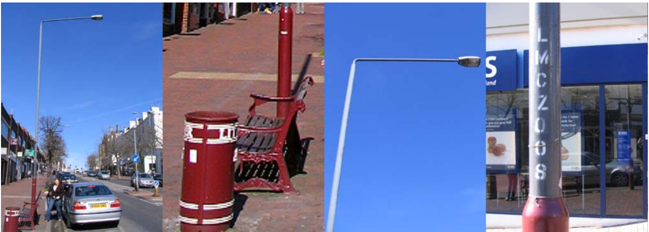
24 / LMCZ008 Mt. Pleasant