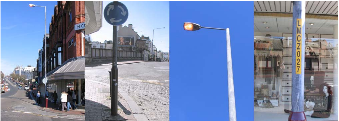
17 / LMCZ027 Mt. Pleasant