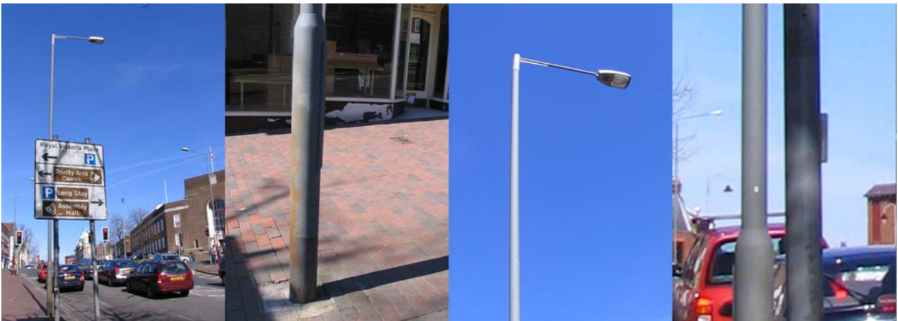
26 / Mt. Pleasant