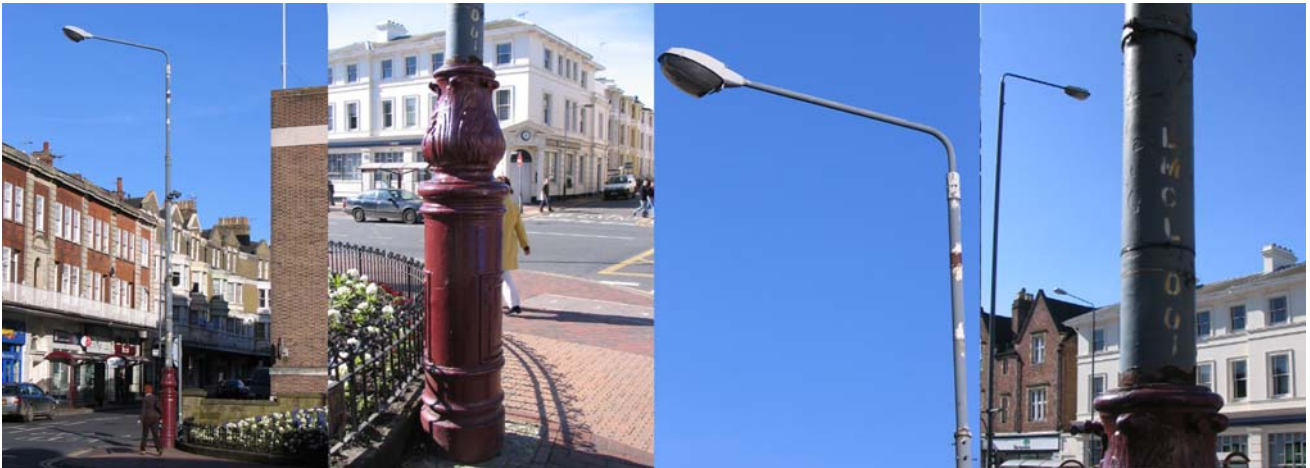
5 / LMCL001 Mt. Pleasant