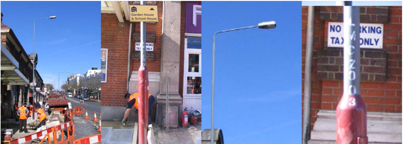
21 / LMCZ003 Mt. Pleasant / Station