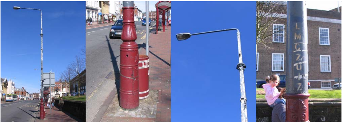
8 / LMCZ017 Mt. Pleasant