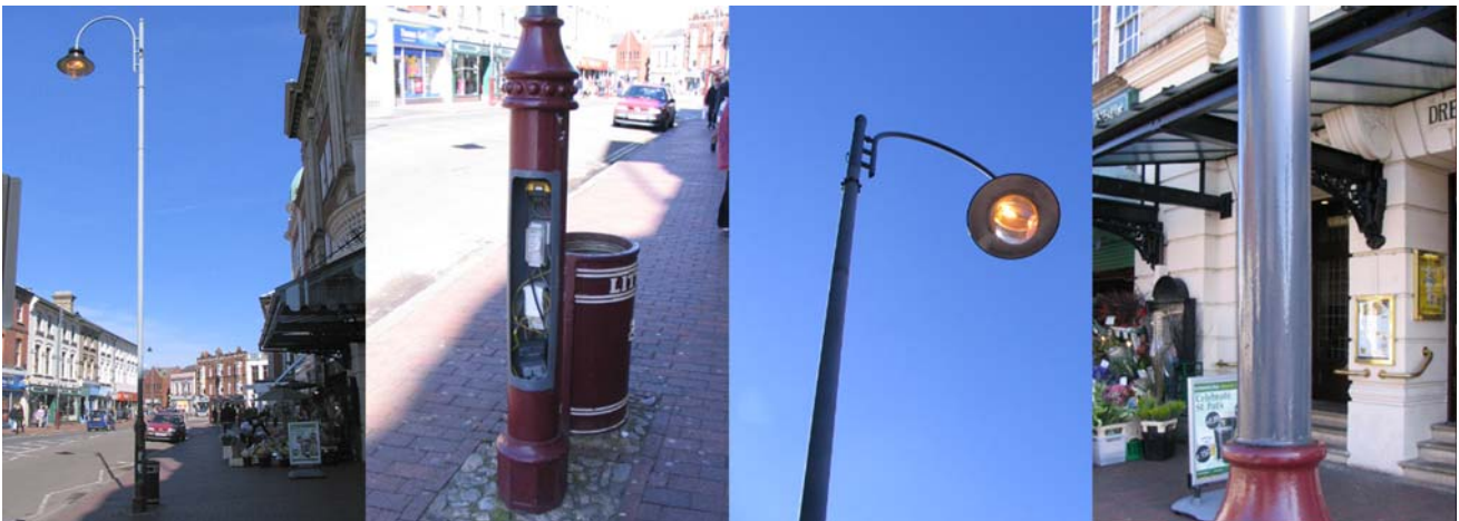
4 / (Opera House) Mt. Pleasant

REMARKS: in contrast to 1/ LGCC002 lamppost is used as bollard