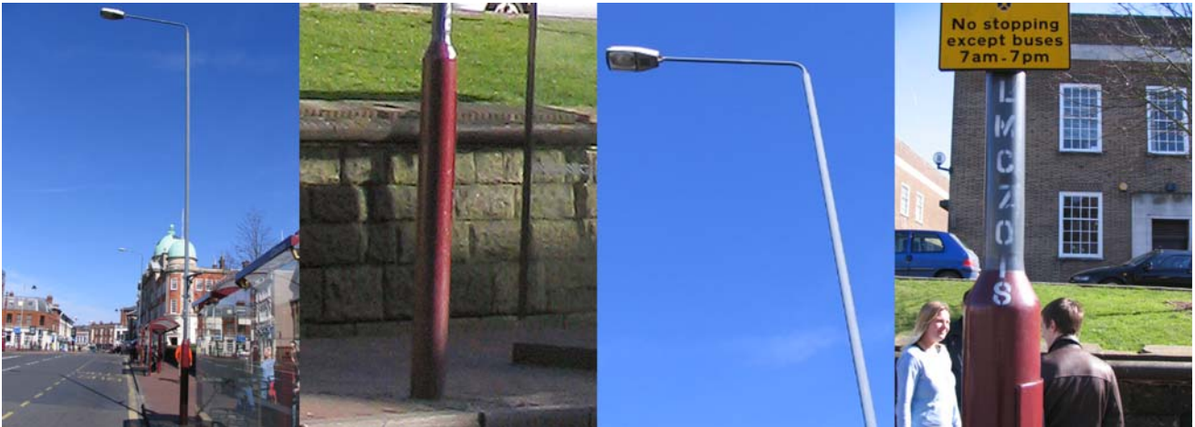
7 / LMCZ018 Mt. Pleasant