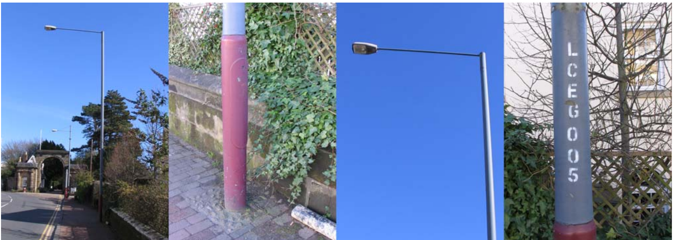
36 / LCEG005 Crescent Road