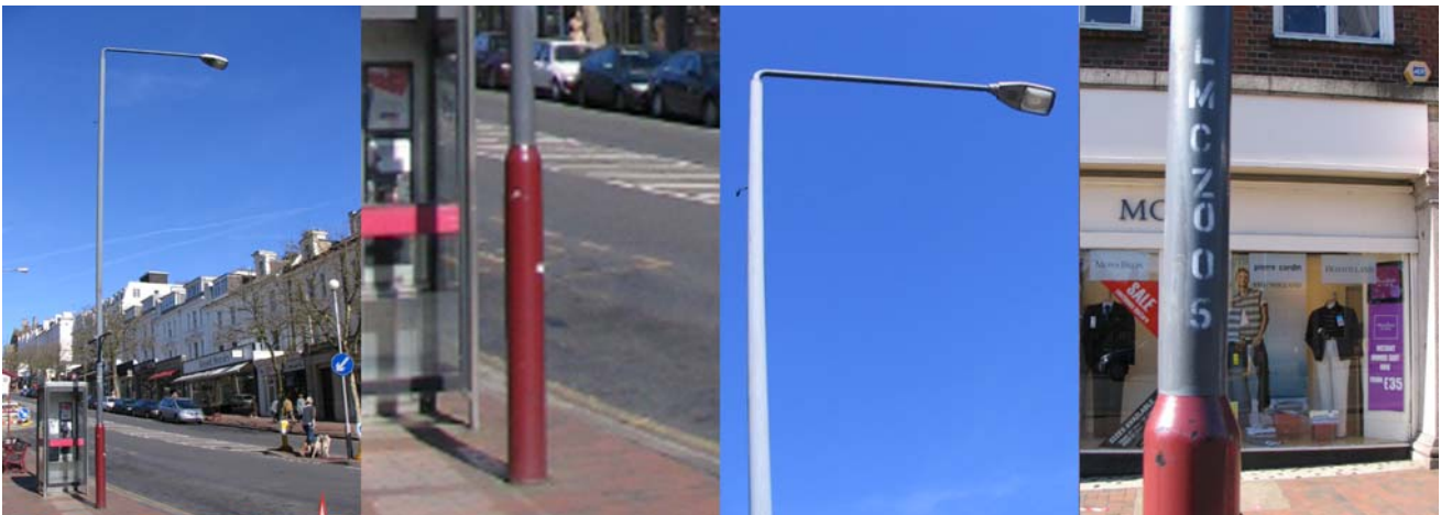
22 / LMCZ005 Mt. Pleasant