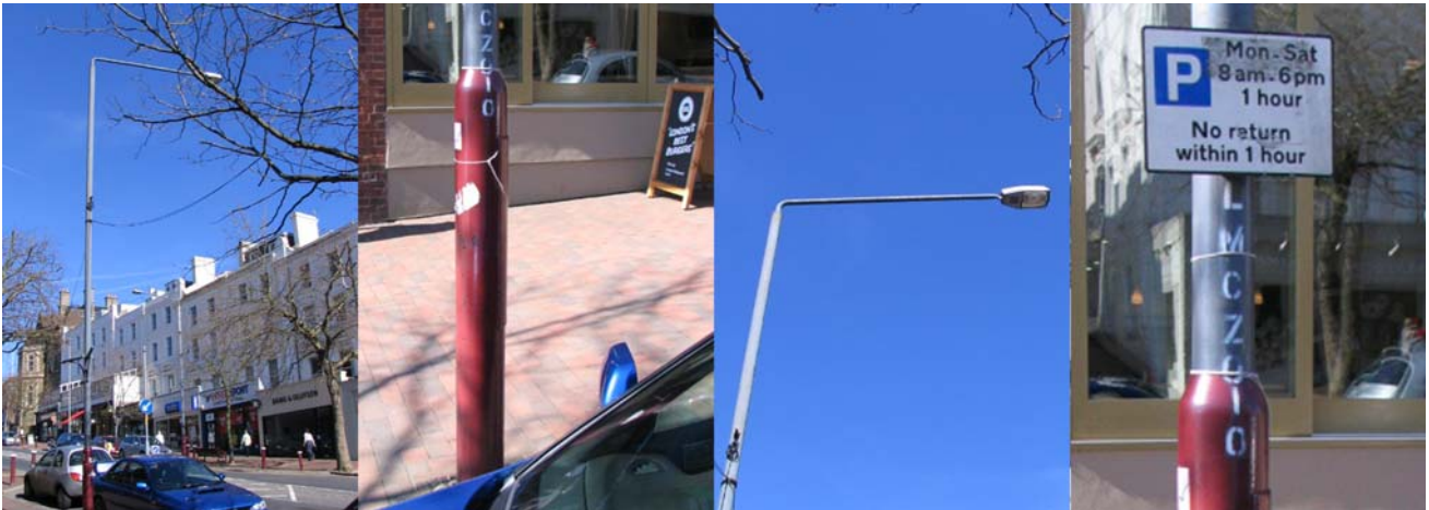
25 / LMCZ010 Mt. Pleasant