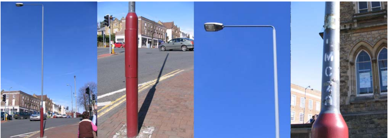
10 / LMCZ0?? Mt. Pleasant