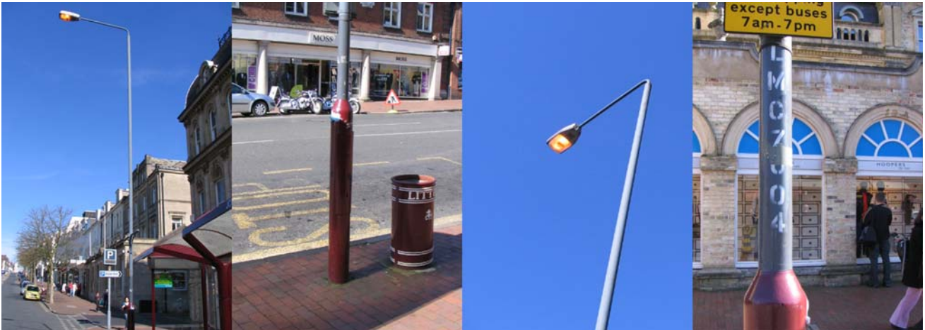
15 / LMCZ004 Mt. Pleasant