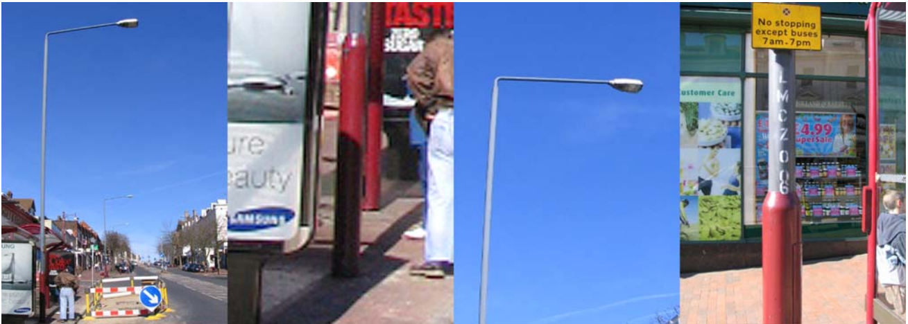
23 / LMCZ006 Mt. Pleasant