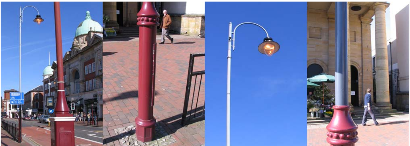
30 / Mt. Pleasant