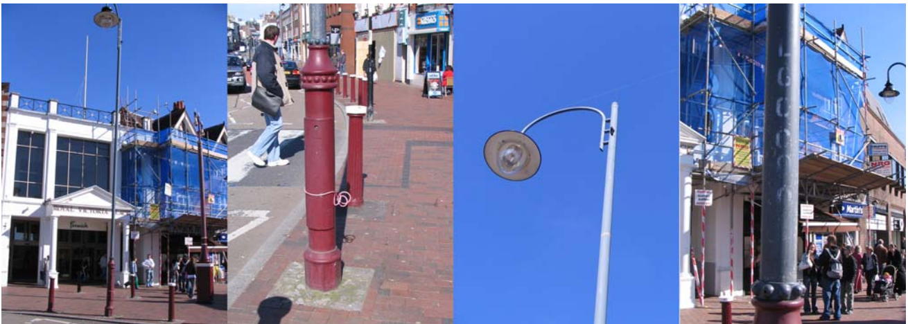
2 / LGCC0?? Five Ways

1) lamppost could replace bollard to avoid clutter