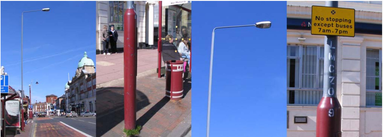
29 / LMCZ019 Mt. Pleasant