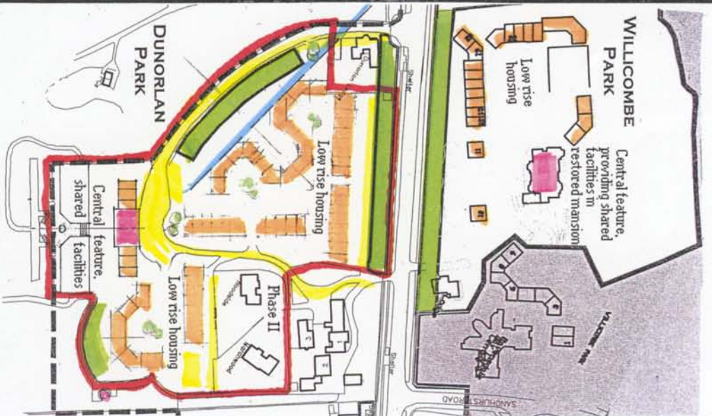
C DIAGRAM ONLY, INDICATING AREA IN NEED OF AN OVERALL PLAN