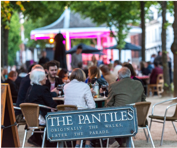
Social Contemporary Buzz Seekers